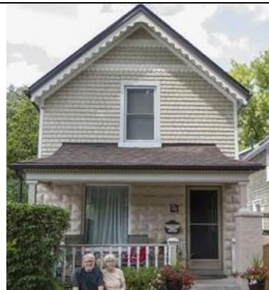
The Cox and Hinds Families – Five Generations in East Toronto By Ken Cox